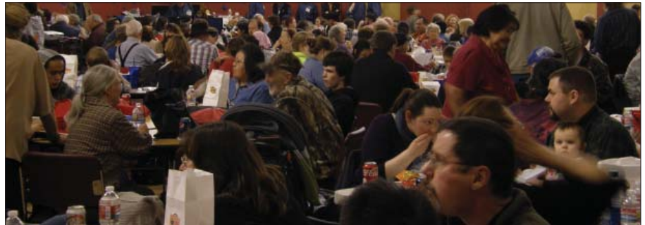
Approximately 310 people attended the meeting in the Copper Basin