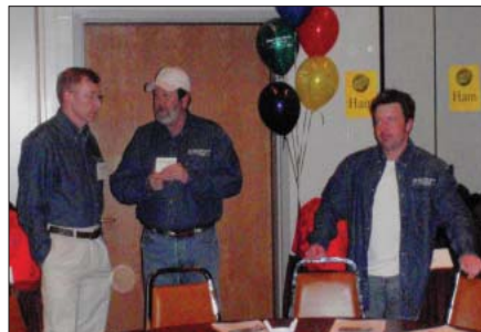
CVEA employees preparing for the Annual Meeting in Valdez