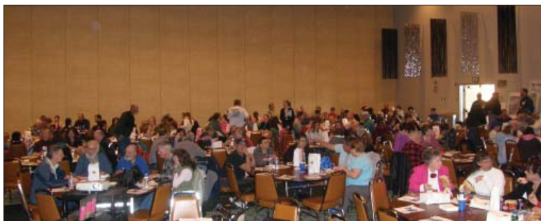
Approximately 250 people attended the Valdez Annual Meeting