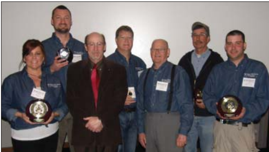
Valdez Employee Service Awards