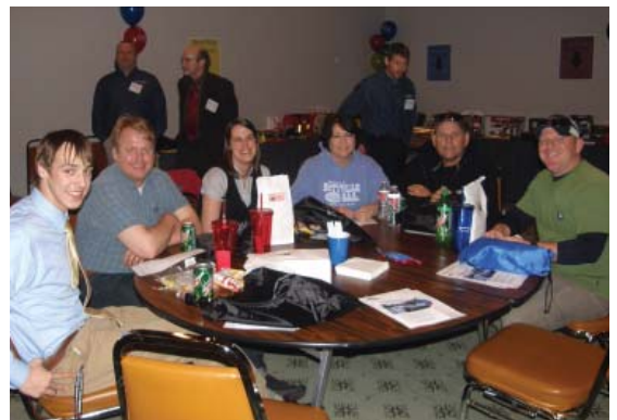
Members pose for the camera at the Valdez meeting