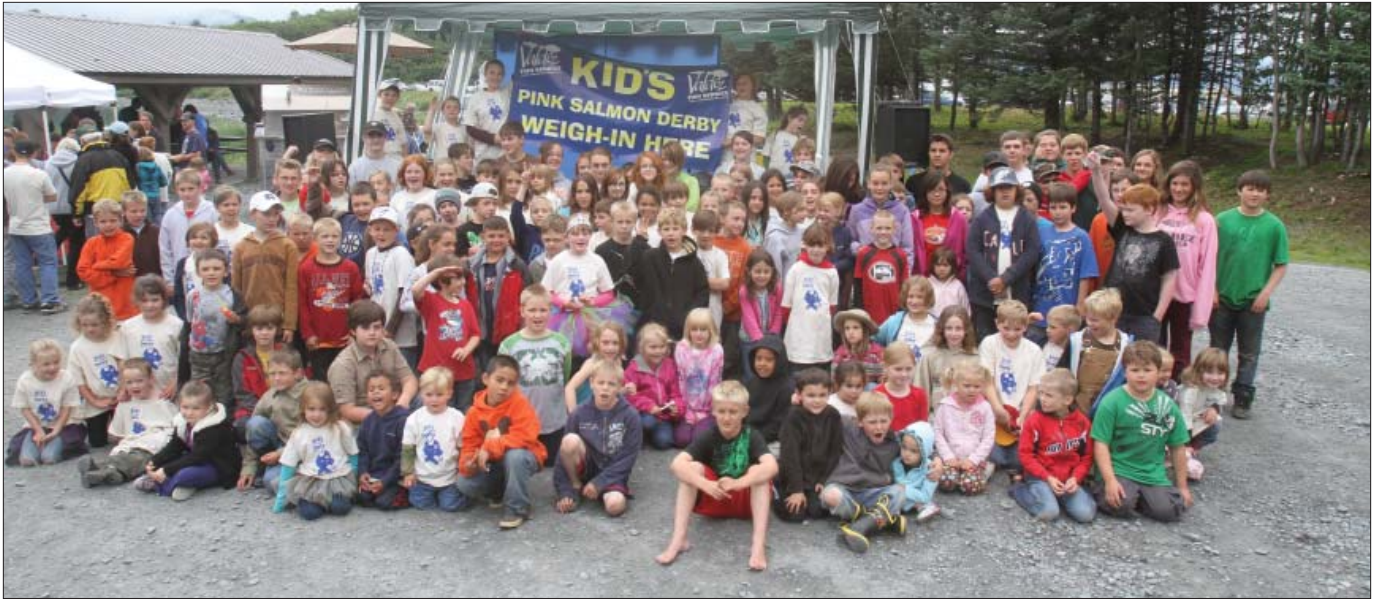
Above, 2011 Kid's Pink Salmon Derby participants